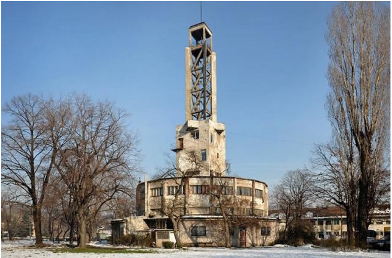
the site of the concentration camp at Sajmište today

By putting Concentration camp at Sajmište in public and international focus, and by creating materials that could be used at the future Memorial, the project aim to contribute to this important task.