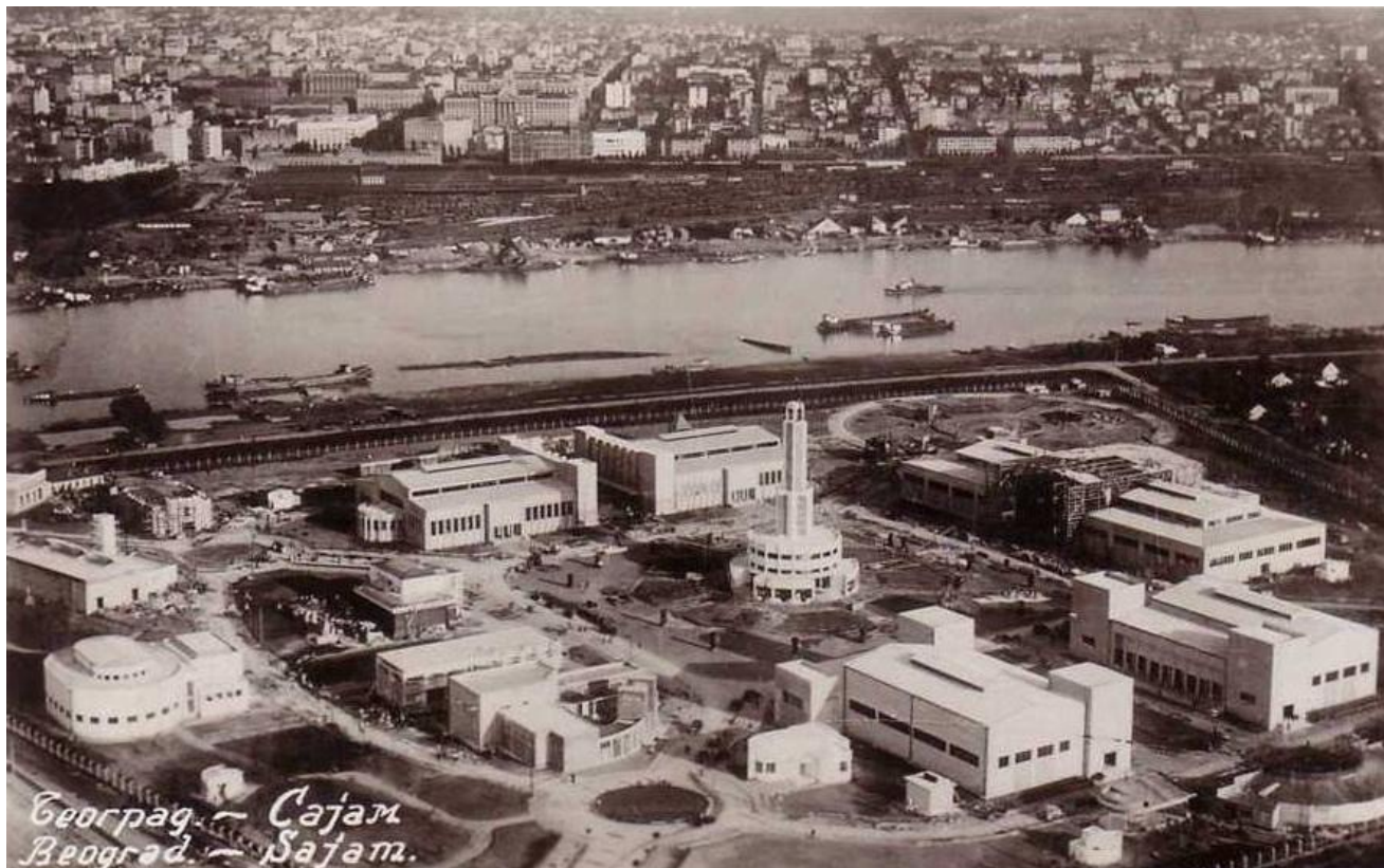
Belgrade Fair Grounds 1938

The first phase of construction on the site of the Belgrade Fair Exhibition Grounds started in 1937. The five Yugoslav pavilions were the first to be built, followed by the Central Tower, Italian, Romanian, Czechoslovakian and Spasic's pavilions. The first Belgrade Fair was opened on September 11th, 1937. In 1938 the opening of the Turkish and German pavilions marks the end of the second phase of construction.